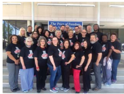
Lab Week celebrations at (L-R) Providence St. Joseph, John Muir, VA Fresno